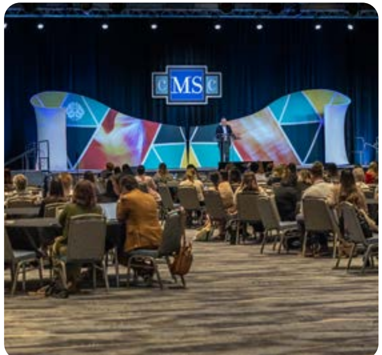
2025 ANNUAL MEETING, PHOENIX, AZ

Important: The number of available credits per professional affiliation may change.