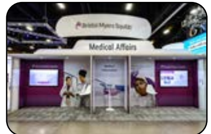
2025 ANNUAL MEETING, PHOENIX, AZ